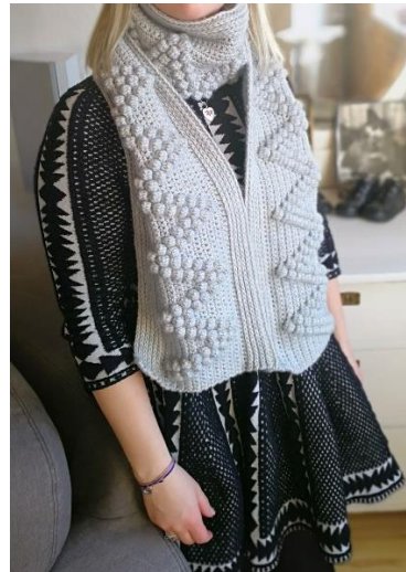
Yarn Svarta Fåret Freja Colour 238 x 4, colour 01 x 1 and colour 16 x 1 Made by @karinnilssonysane