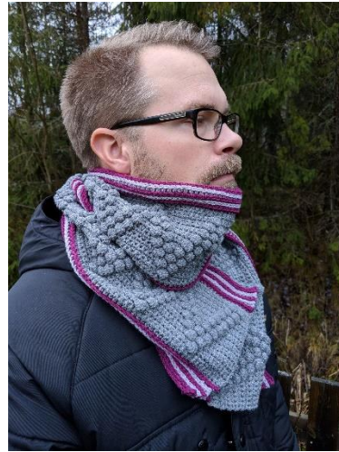
Original yarn: Katia Atlantic x 5 balls Made by Virkevira