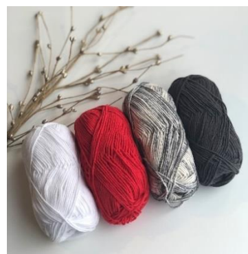
Colour pack 01 – Swedish Christmas

Yarn kits including patterns: www.favoritgarner.com | Pattern shop: www.gicona.com