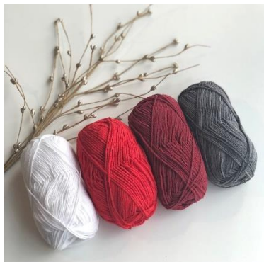
Colour pack 16 – Hooked by Anna

The original cushion is made in the colour pack "01 – Swedish Christmas" (5 x 2412, 4 x 2410, 4 x 806 och 4 x 2532)